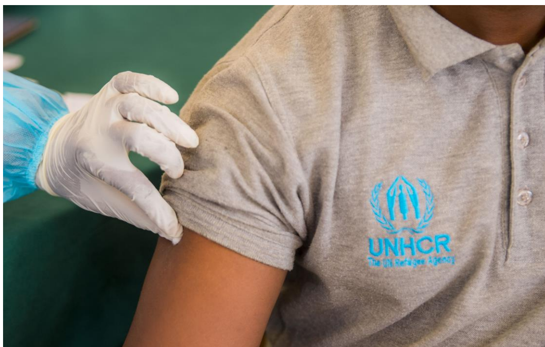
Refugees and asylum-seekers receive their first dose of Covid-19 vaccine at the Emergency Transit Mechanism centre in Gashora, Rwanda.

Since the launch of the national COVID-19 vaccination campaign in March 2021 in Ethiopia , 2 million people have been vaccinated to date, prioritizing frontline health workers, individuals with severe underlying medical conditions and elderly people. Refugees meeting the government's criteria continue to access the vaccines. The country is reportedly facing a shortage of the second dose of the vaccine. Refugees and asylum-seekers have been granted access to Government's testing and treatment centres while UNHCR continues to provide support, including equipping the Government's testing facilities and setting up temporary isolation centres in each of the refugee camps.