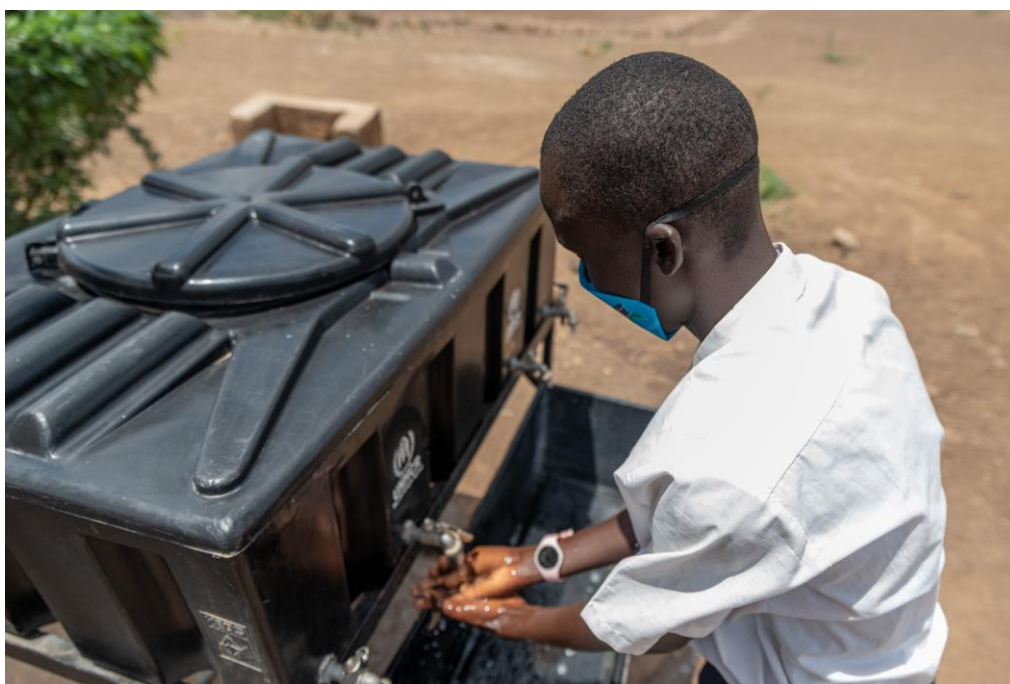
A young student at Arid Zone Primary School, Kakuma Refugee Camp washes their hands with soap and water before accessing the school's facilities.

A total of 36,451 handwashing stations have been installed in communal centers and households in the different refugee camps to promote regular handwashing with soap. More capacity is needed however, to ensure that all refugee camps have such facilities in place and that every refugee household is equipped with a handwashing facility. The host communities living next to the refugee camps are included in the response.