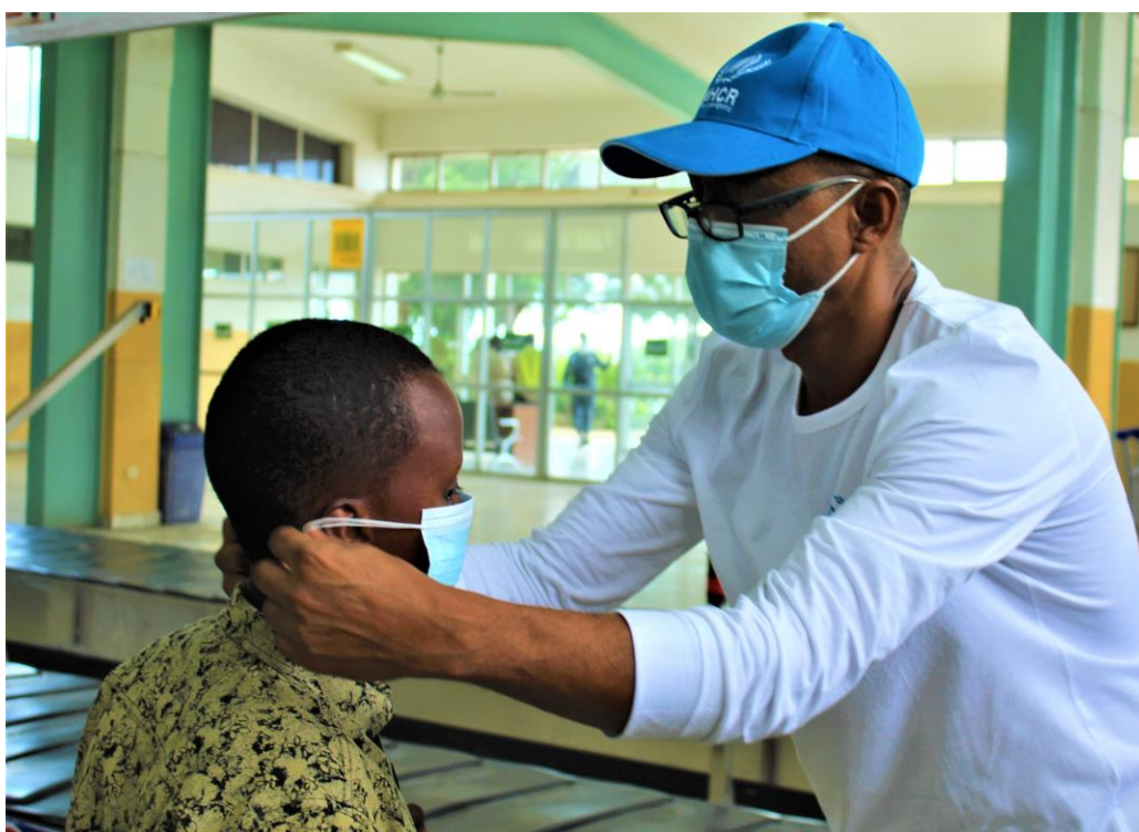
A refugee child in Kenya being assisted to wear a face mask.

UNHCR continues to manage logistics of the Voluntary Repatriation Convoys. The reporting period witnessed a sharp increase in COVID-19 cases being detected at the border entry points during voluntary repatriation activities. Some 58 cases among the returnees from Tanzania tested positive for COVID-19 (54 from Nyarugusu camp alone). 164 positive cases of COVID-19 have been reported since the beginning of 2021.